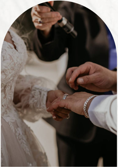
The 2027 season's first stop for wedding planning