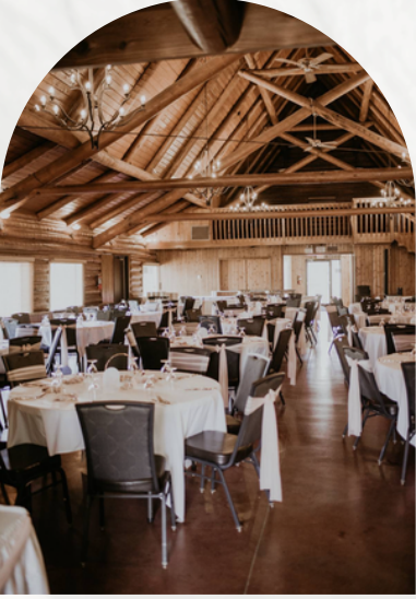
Fully styled wedding setup