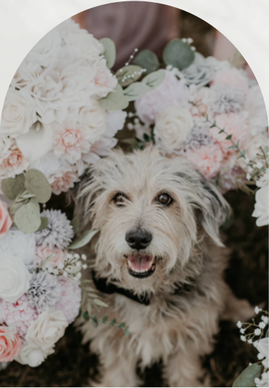
Inspiration curated for engaged couples

Guests will tour beautifully designed spaces, sample exceptional catering, meet talented vendors (like yourself!), and envision their wedding brought to life. All in one place!